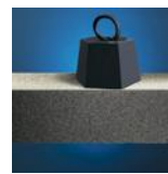
High compressive strength