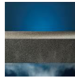
Impervious to water vapour