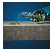
Acid resistant / chemical resistant