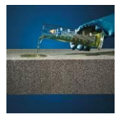
Acid resistant / chemical resistant