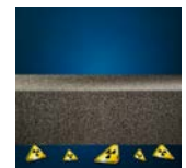
Radon protection stable