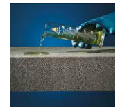
Acid resistant / chemical resistant