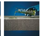
Acid resistant / chemical resistant