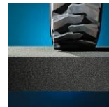
High compressive strength