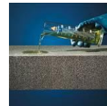
Acid resistant / chemical resistant