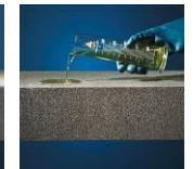
Acid resistant / chemical resistant