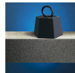
High compressive strength