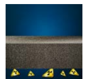
Radon protection stable