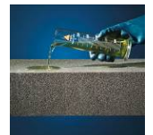
Acid resistant / chemical resistant