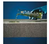
Acid resistant / chemical resistant