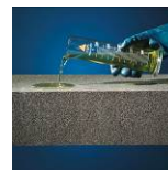
Acid resistant / chemical resistant