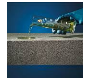
Acid resistant/chemical resistant